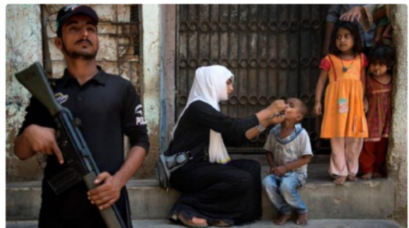
A Pakistani policeman stands guard as a health worker administers polio vaccine to a child during a vaccination campaign in Karachi in April 2017.

Taliban militants have attacked polio workers in the past in Pakistan -- one of only three countries where the crippling disease remains endemic.