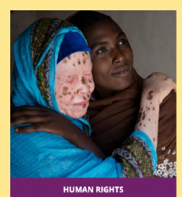
Rotary helps Tanzanians with albinism overcome stigma and superstition to find safety and a livelihood.