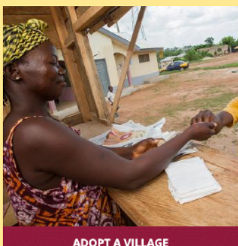
ADOPT A VILLAGE

Rotary members use a multifaceted and coordinated strategy to break the cycle of poverty in extremely impoverished communities.