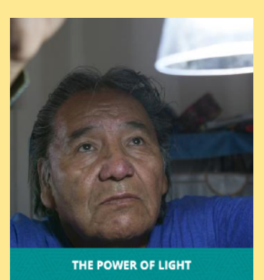
Rotary members team up with the Navajo Nation to bring solar lights to remote, off-the-grid homes, allowing people to work and learn at night.