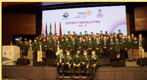
All Imagine Rotary Presidents