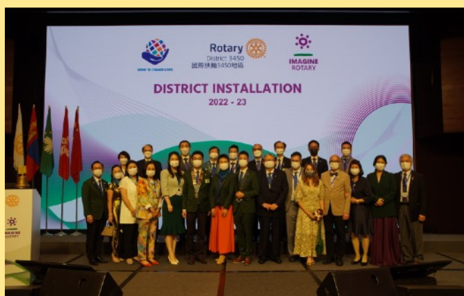
HKIE Club Members attending District Installation