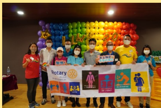
HKIE Members attending LLWS event

6 August 2022 was the 20th Anniversary event for the Little Life Warriors Society (LLWS).