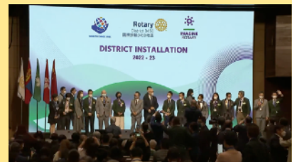
Installation of Area 3 Imagine Rotary Presidents