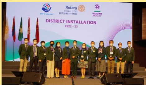
All Area 3 Imagine Rotary Presidents