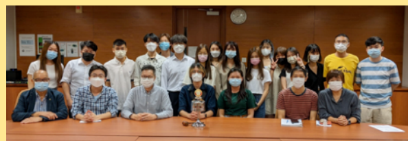
Incoming and current board members of the Rotaract Club of HKCC Students' Union