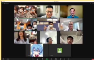
Interact Club of HCSS Board Meeting