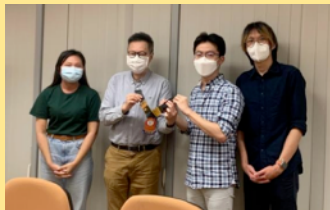
Rotaract Club of HKCC Installation