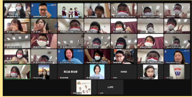
Junioractors and kids at Little Life Warrior Society saying goodbye to each other

On 4 June 2022, C.C.C. Kei Wan Primary School (Aldrich Bay) had successfully held an online event in collaboration with one of our service partners, Life Warrior Society. Fifteen students from C.C.C. Kei Wan Primary School (Aldrich Bay) and nine children from Little Life Warrior Society participated. Two fun games namely 'Object Guessing' and 'Bingo' brought the students and children together in harmony with laughters.