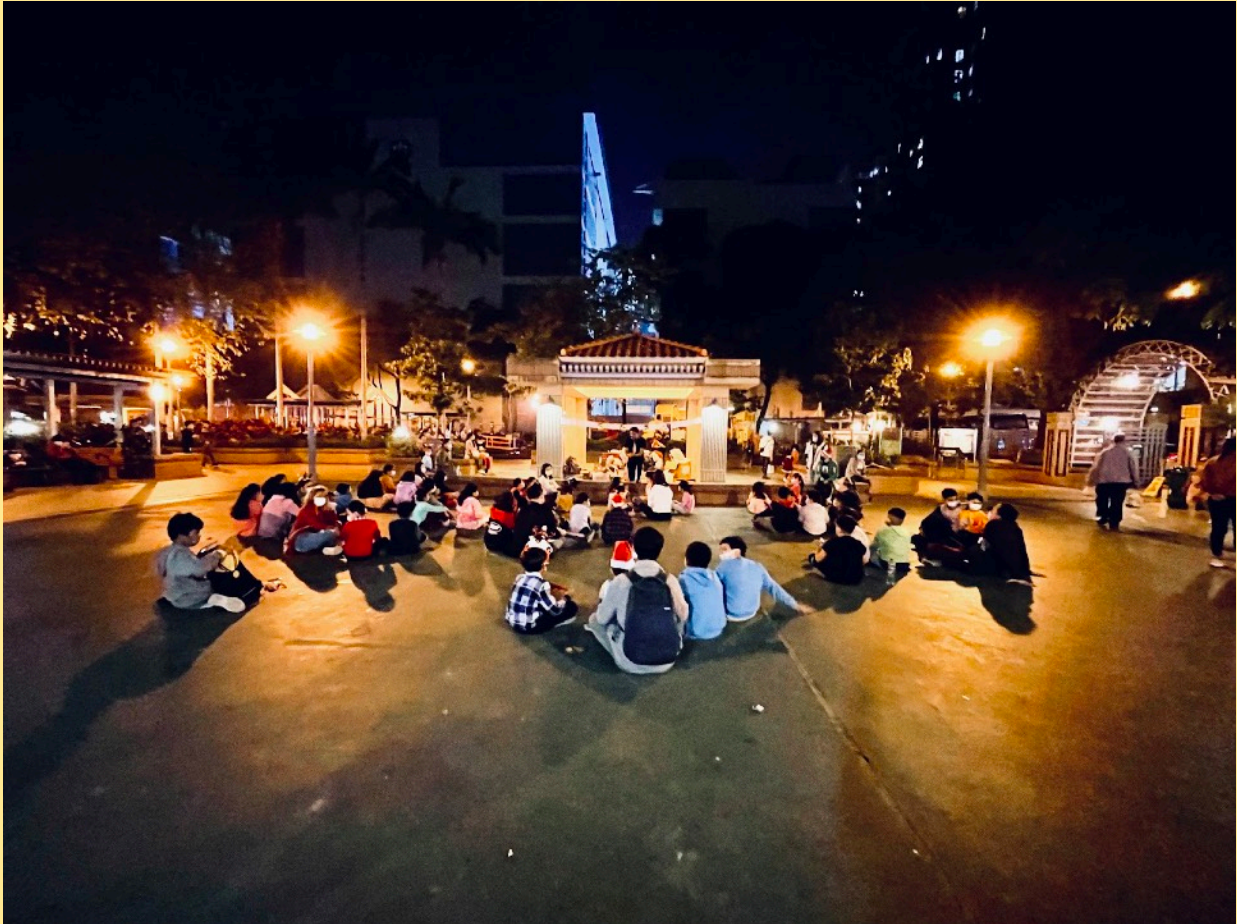
Ultimate United volunteers sharing love and good news to kids of Yau Tsim Mong