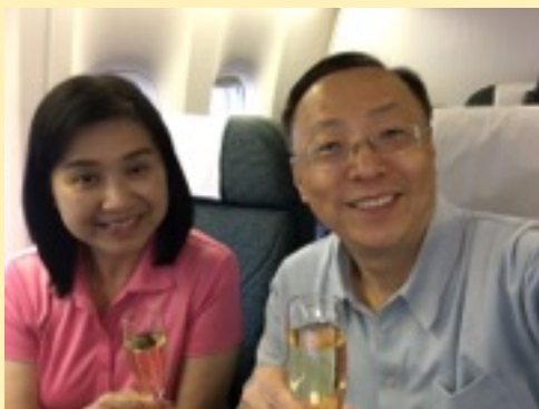
A well-earned break