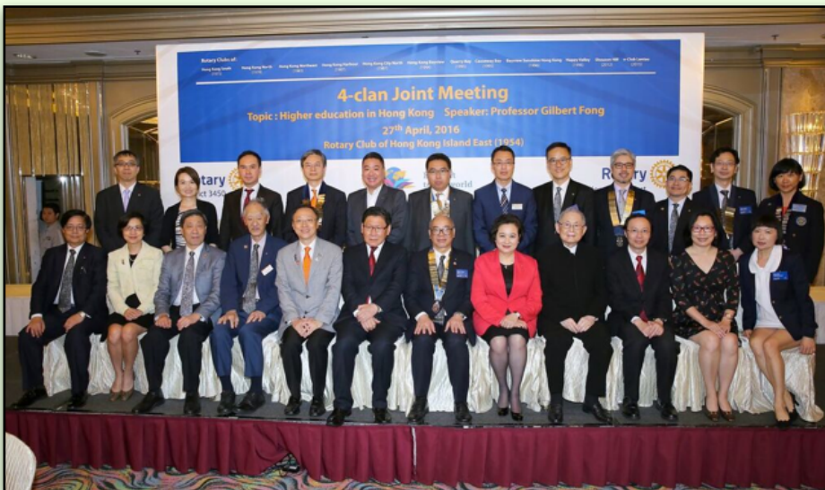
All the President's Men (and ladies)

With our involvement in next years Rookie Stars dance contest at regional level, and other youth projects we will be involved in, let's ensure that we are as much an example to our youth as Rotarians, as they are to their own contemporaries.