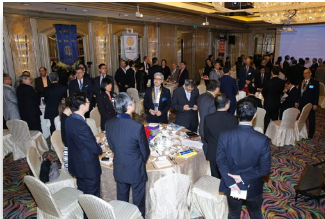
Attendance problem? What attendance problem?