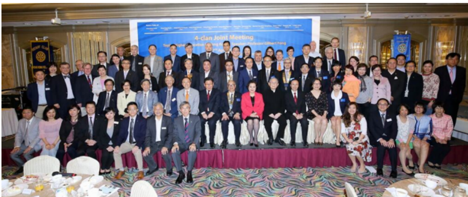
The Guinness Book of Records entry for most number of Rotarians on one stage at the same time...