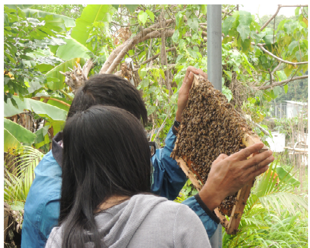
Showing the honey to the student of Holy Carpenter