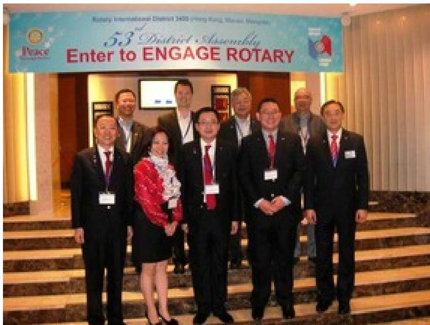
DGE Eugene with HKIE members