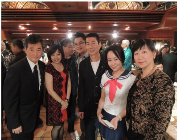
International Yachting Fellowship Rotarians (IYFR)