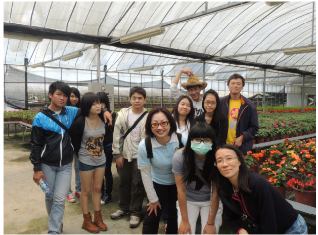
Visiting in-hse 蘭花園