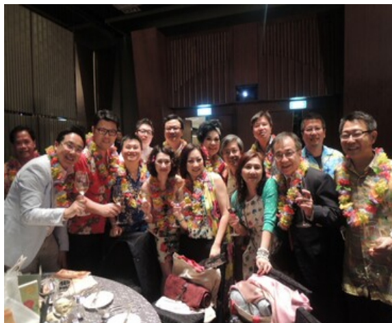
Presidents of this year