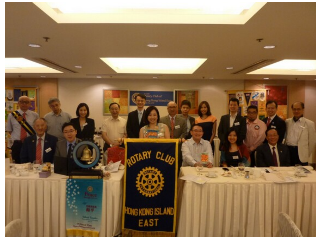
The group photograph of our meeting on 19 th of June, 2013