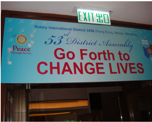
Theme of 2013 -14