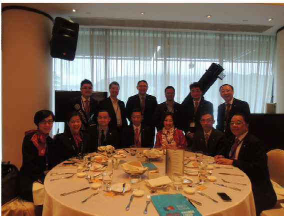
Members from HKIE & HK Harbour