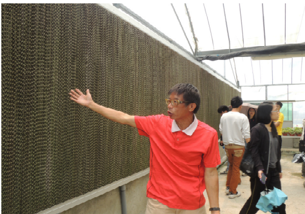
Auto water system