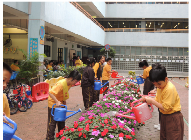
Students watering the plants during recess