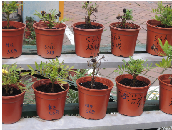
Different planting from students of Choi Jun