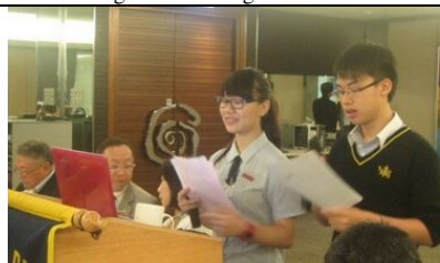
Two Rotaractors reporting on their activities for the year.