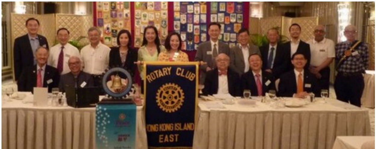
Group photo of members, guest speaker and visiting guests.