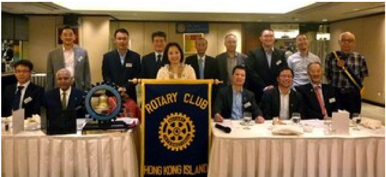
Group photo with visiting Rotarians from HK Harbour & Tai Po, visiting guest and members of RC of HK Island East