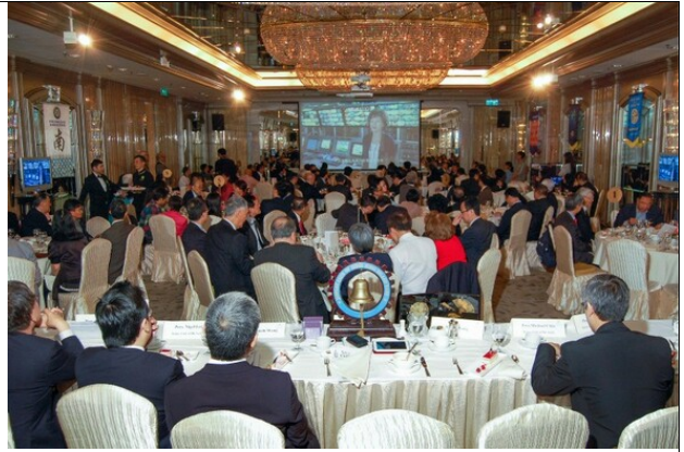
Another photo from the head table.