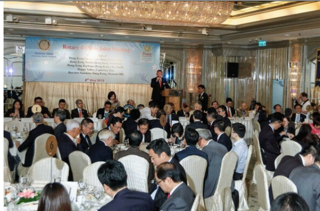
Photo of the audience listening to the speaker.