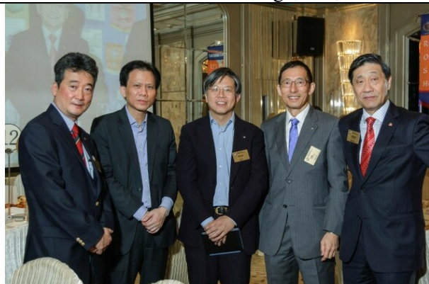
Members from the Hong Kong Harbour Rotary Club.