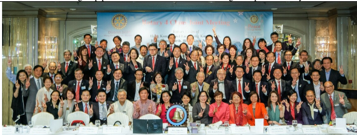
All agree that it is a successful meeting giving the V-sign.