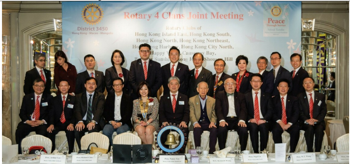
The Presidents of the Ten Rotary Clubs and the VIP's.