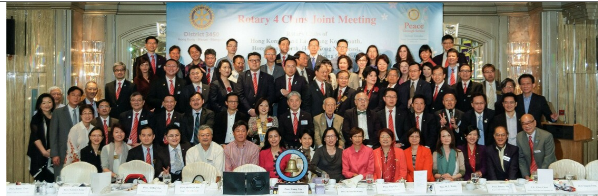
A group photo of most of the audience and guests present today.