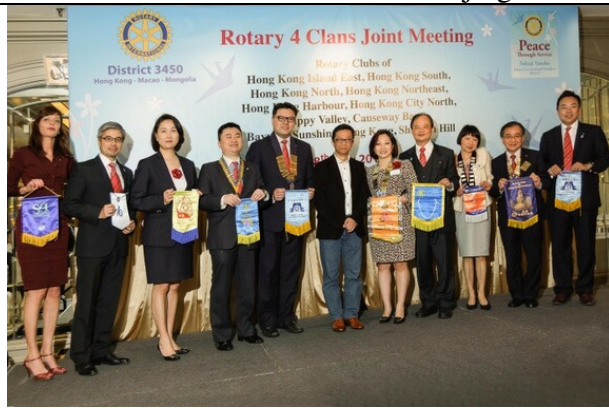
Ten Club Presidents showing off their club banners