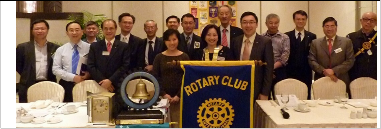
Group photo with members of Hong Kong Island East