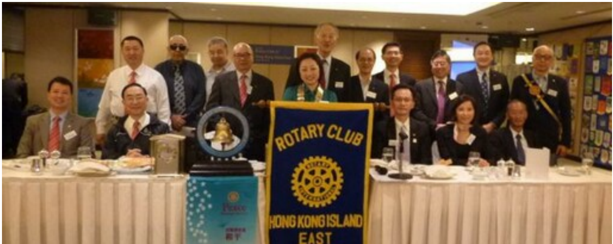
Group photo with members of Hong Kong Island East