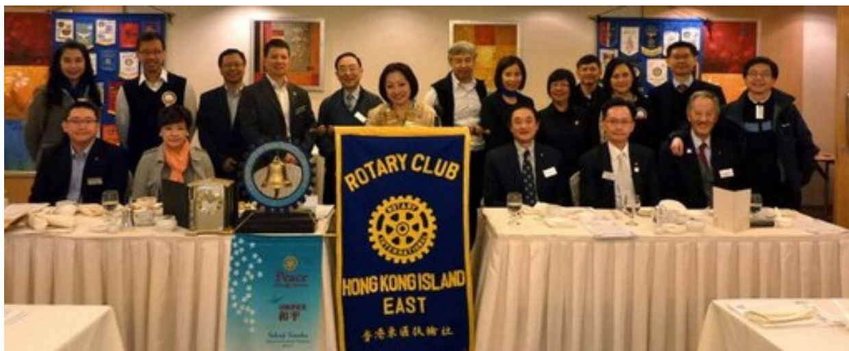
Group photo with members, guest speaker & visiting guests