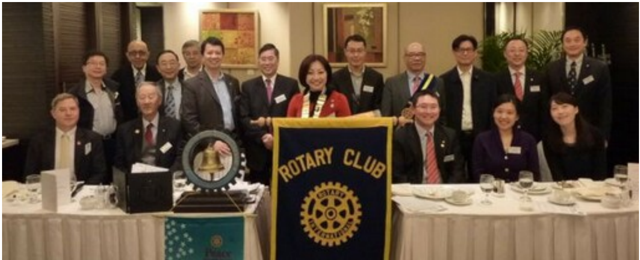
Group photo with members and visiting Rotarian & Rotaractor