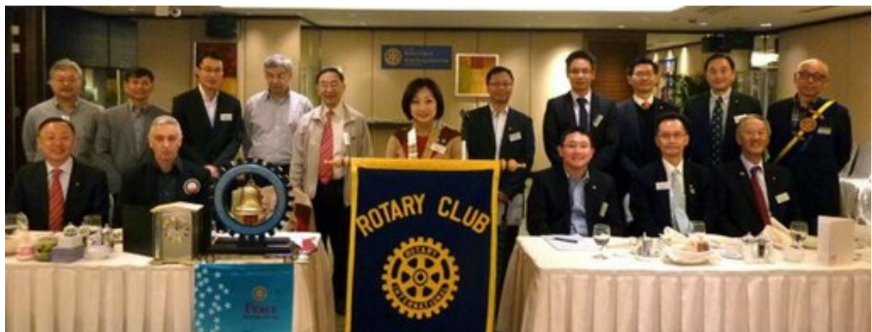
Group photo with our Club members & guest speaker