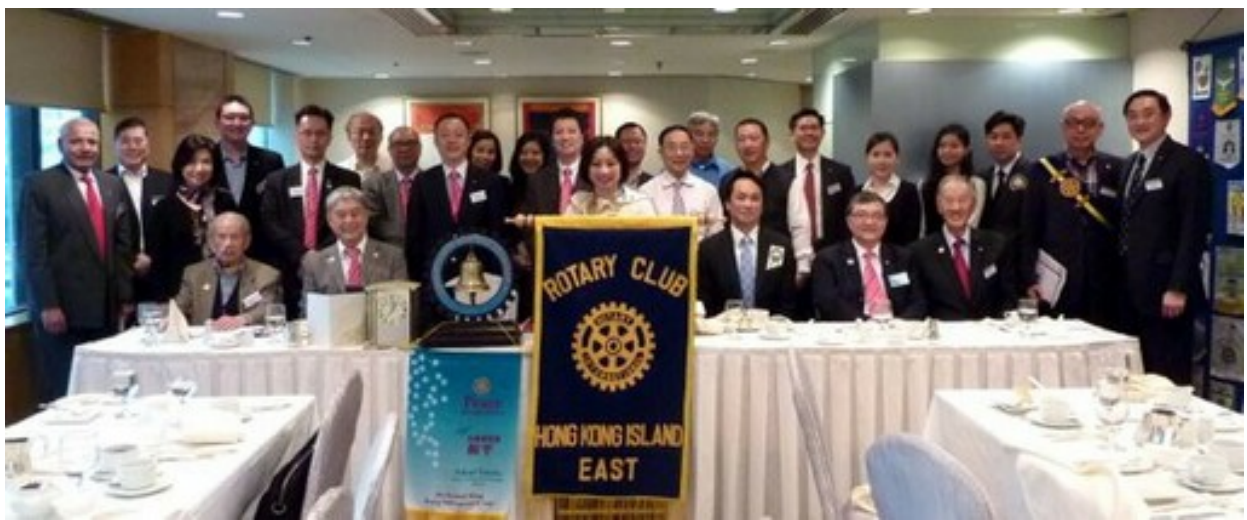
Group photo with members, visiting Rotarians & guests