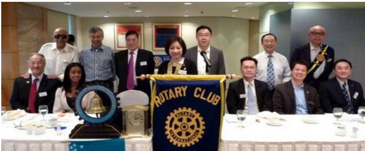
Group photo with guest speaker, visiting guest and members of Hong Kong Island East