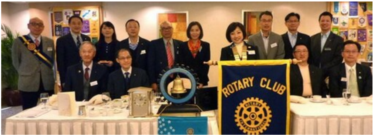
Group photo with members, Rotaractor & guest speaker