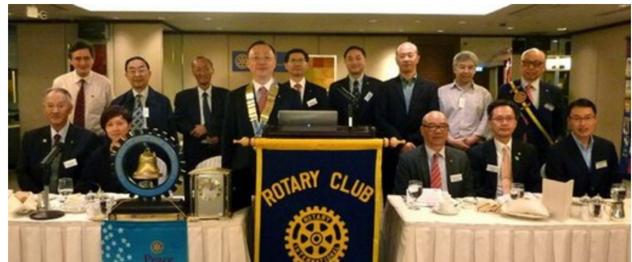
Group photo of members with guest speaker & visiting guest.