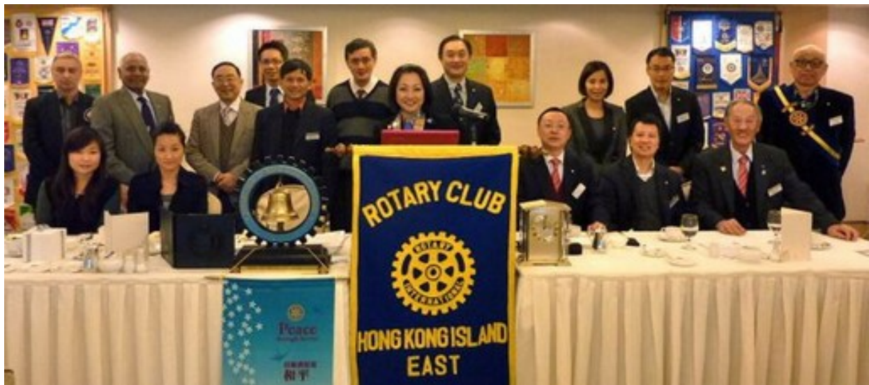
Group photos with members, guest speakers & visiting guest