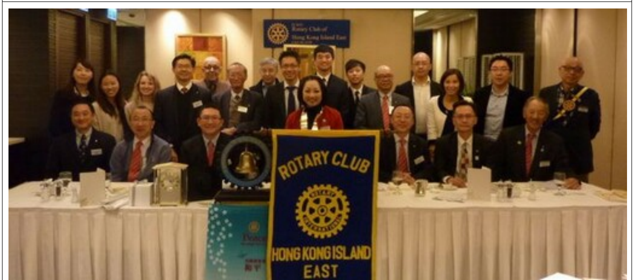
Group photos with members, Rotaractors & visiting guest