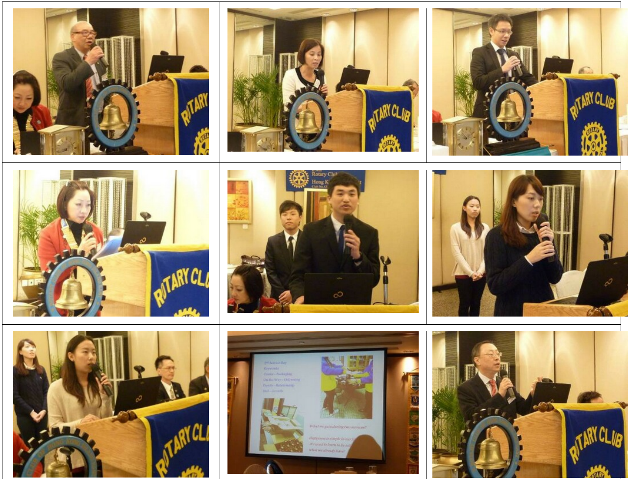
Reported by all the Service Chairs & Rotaractors