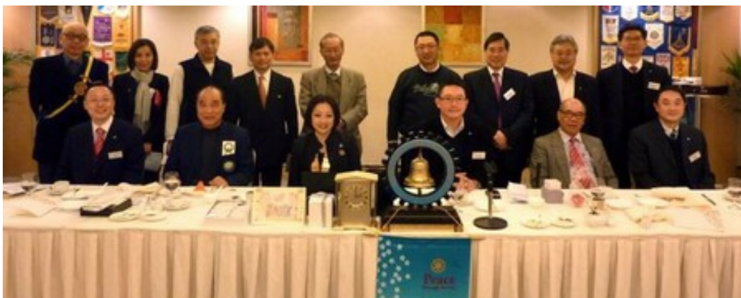
Group photos with members & guest speaker.