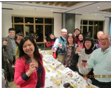
Cheers every one