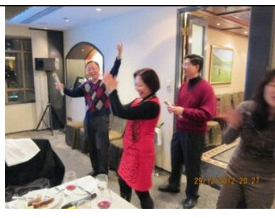
Enjoying the karaoke singing