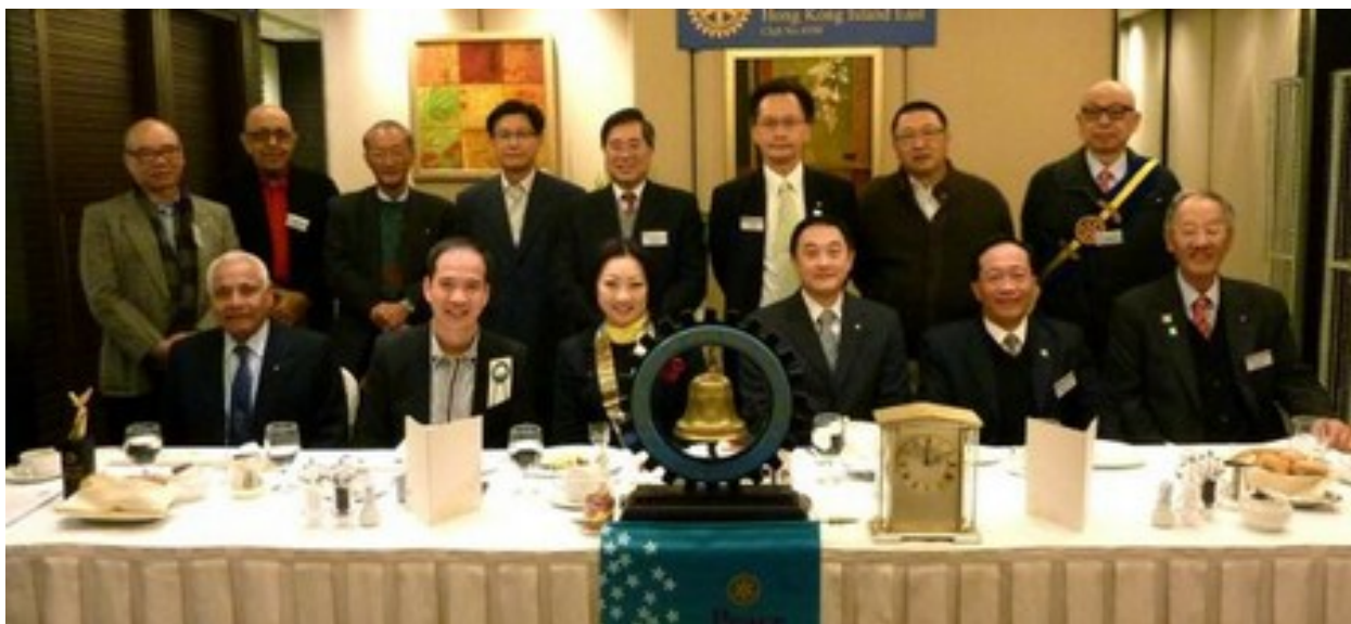
Group photos with members & guest speaker