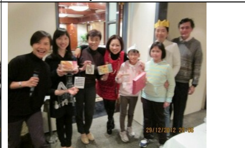
Everyone are winners in Bingo