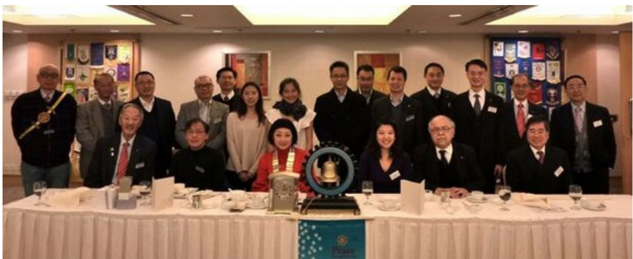
Group photos with members, visiting Rotarians, & Rotaractors.