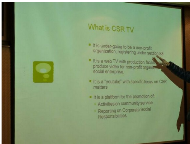
Rtn. Dominic also working on a project called CSR TV