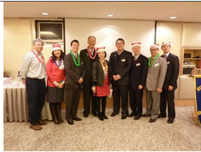
The officers and directors of our club for 2013-2014