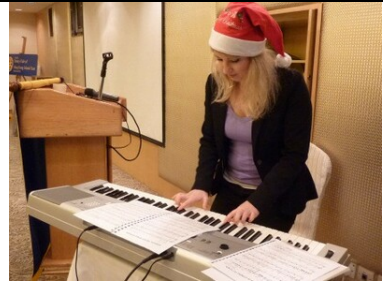
She plays the piano to lead our Christmas songs