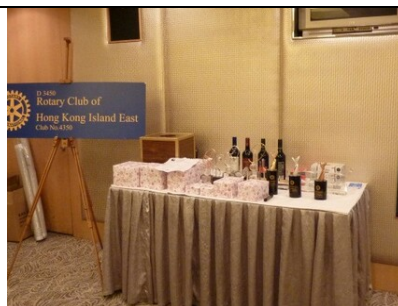
The trophies on display.