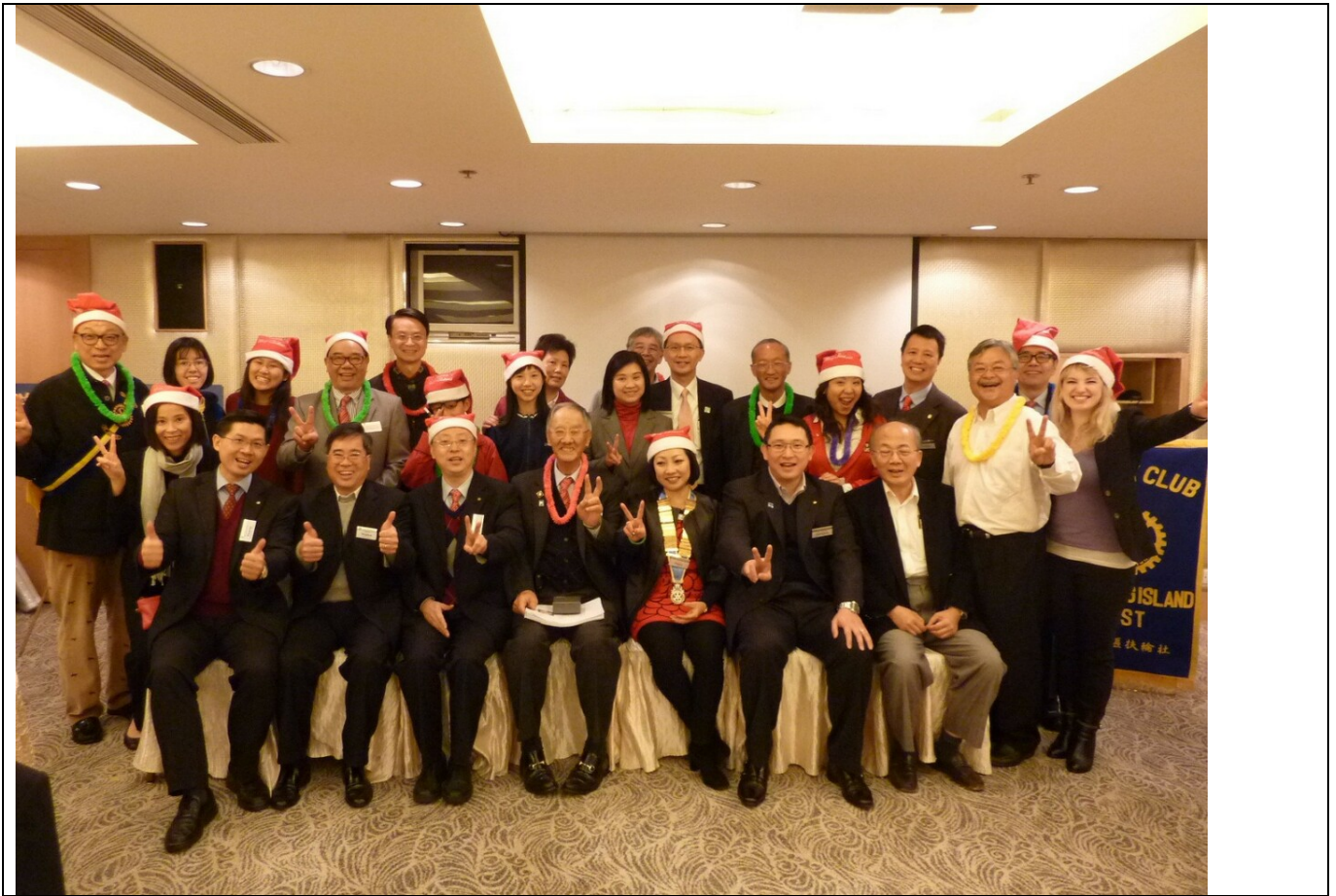
Group photo of our happy gathering on 19 th Dec., 2012