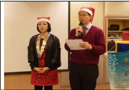
PP Heman announcing the results of the Uncle Peter's golf tournament.