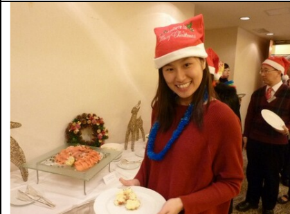
Foods being served