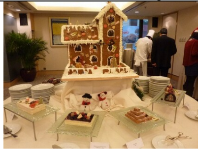
A beautiful ginger bread cake dessert table