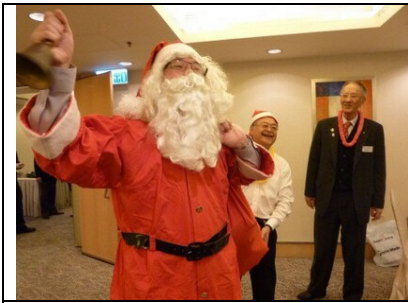
Here comes Santa Claus!!