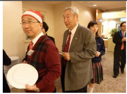
The lineup for food