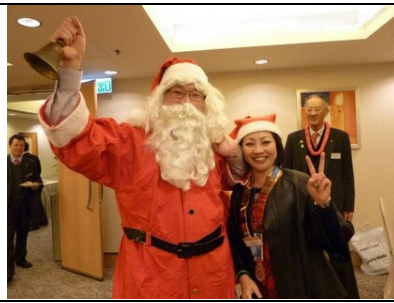
Can you guess who he is?