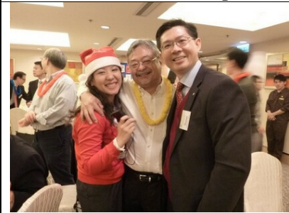
Three happy Rotarians