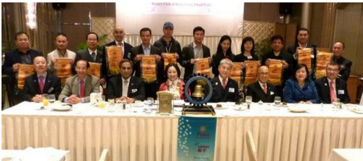
Group photos with members, visiting Rotarians, & visiting guests.