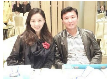
A delegation from Guangzhou came to visit our club