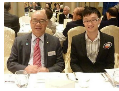
More visiting guests attended our club meeting