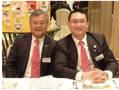
Above are member photos of RC of Hong Kong Island East