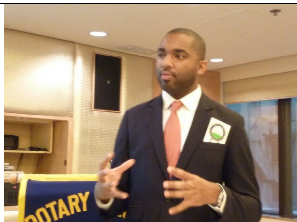
Rotary ambassadorial Scholar giving his talk about where he comes from and what he is studying.