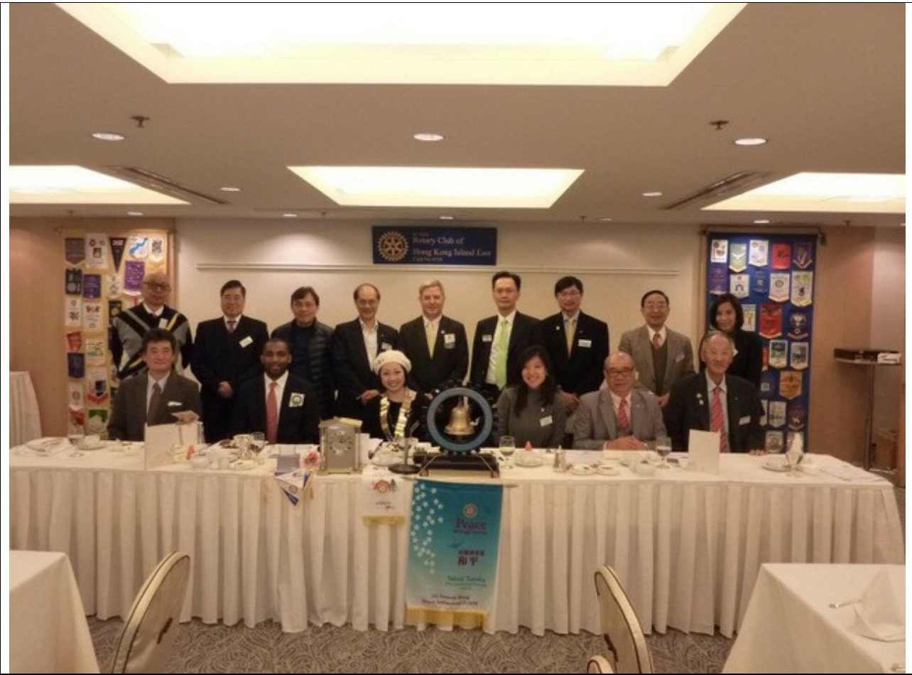
The group photo of our meeting on 5 th Dec., 2012