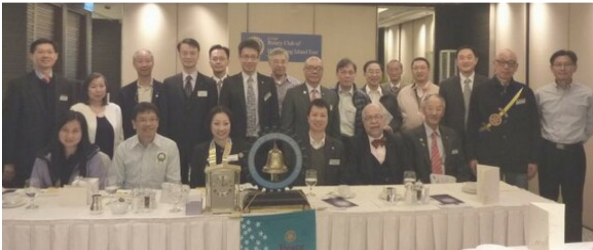
Group photo with members, visiting Rotarians & guests.