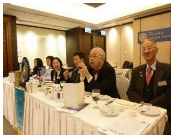
Full of smiling faces at our luncheon meeting