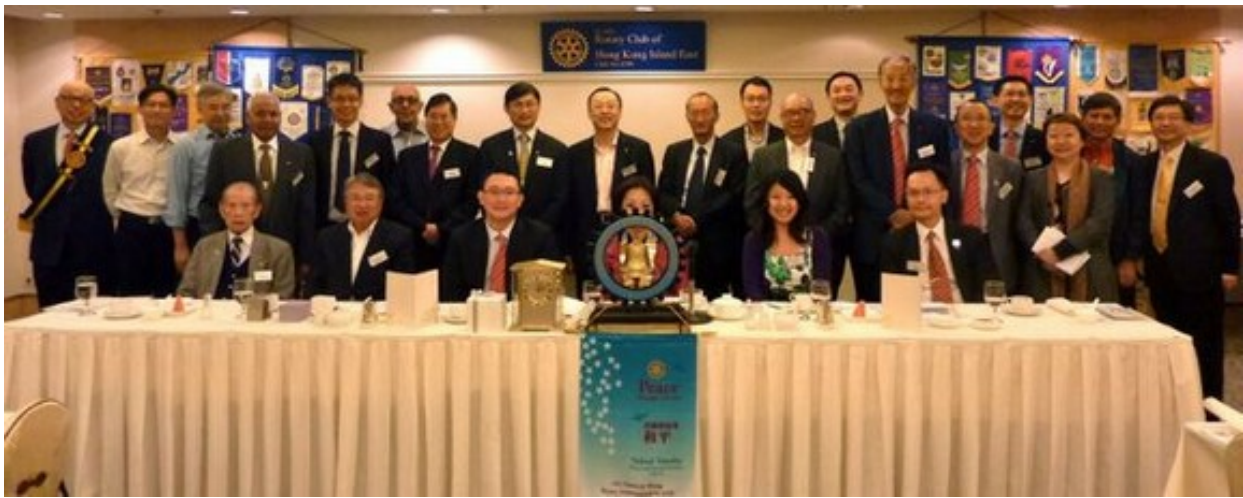
Group photo with members from HK Island East