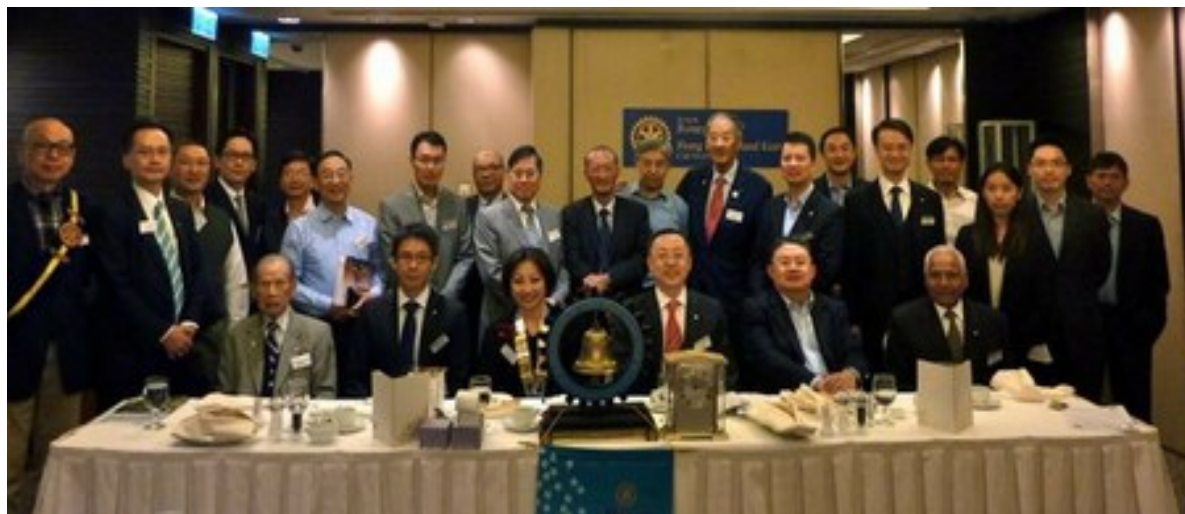
Group photo with members, visiting Rotarians & guests