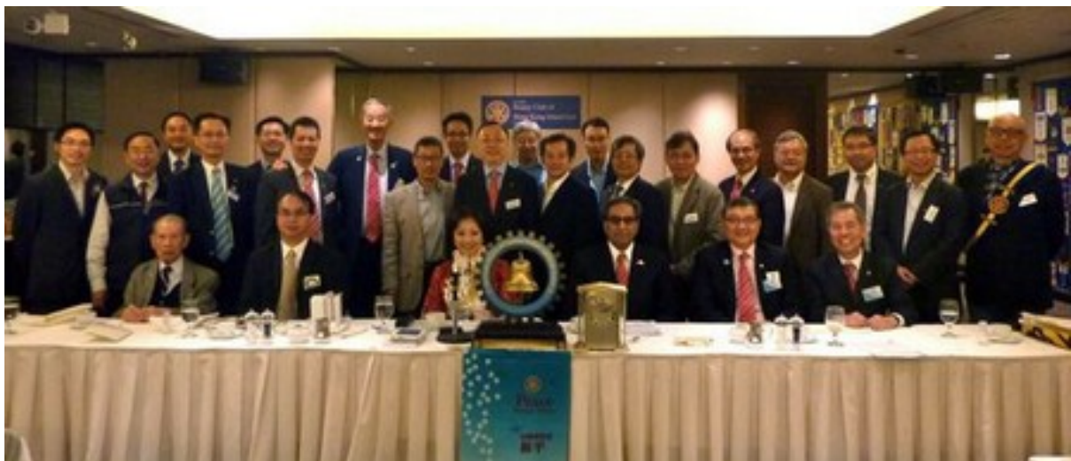
Group photo with members, visiting Rotarians & guests