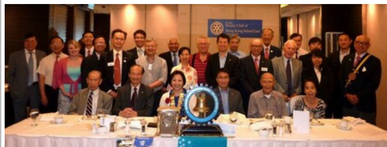
Group photos with HKIE members, visiting Rotarians, Rotaractors & visiting guests.