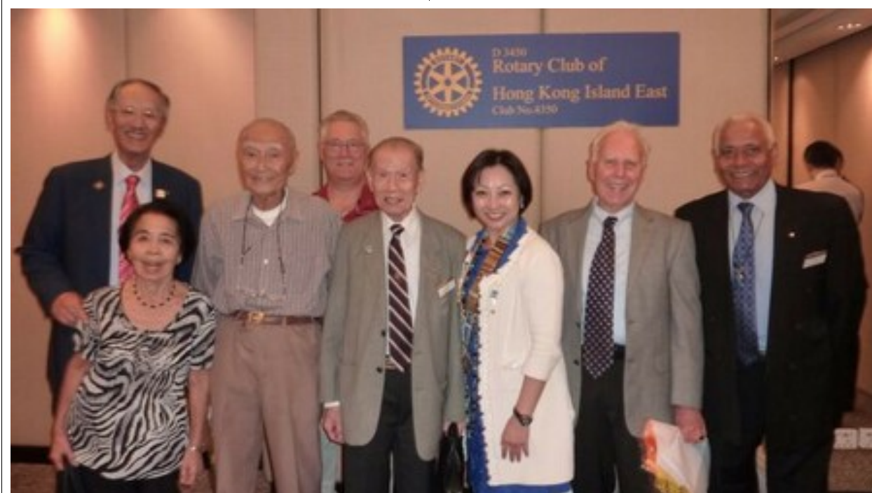
Group photos with all the visiting Rotarians & guests.