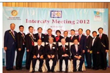
OC Committee members and RI PP & DG