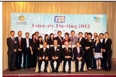
RI PP , Dg & Area 4 from HK North,& Lan Kwai Fong