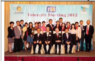
RI PP , DG and the members of Area 4 Bayview, City North