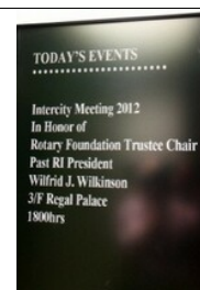
Signage for our meeting