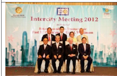
RI PP , DG & members from the Peak