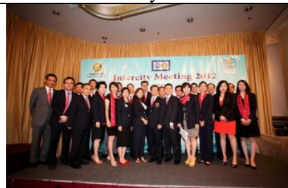
Presidents of all clubs ready to sing