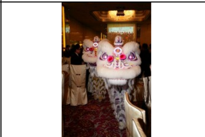
Lion Dancing in