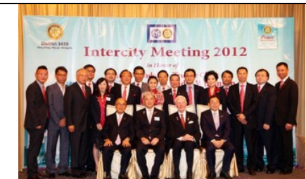
RI PP DG, & Area 8 members