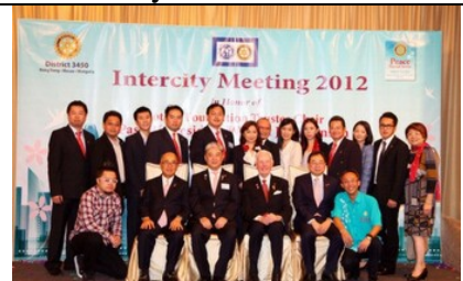
RI PP, DG and members of Area 4 Soho