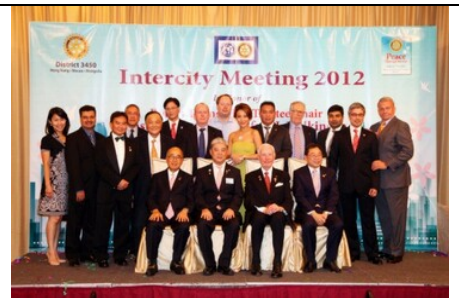
RI PP , DG with members of Rotary Club Shouson Hill