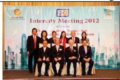
RI PP , DG & Area 7 members