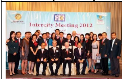
RI PP, DG & members from Area 6 from Tai Po, Shatin & Tsuenwan