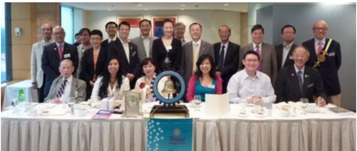
Group photo of Members of HKIE with visiting guest & guest speaker