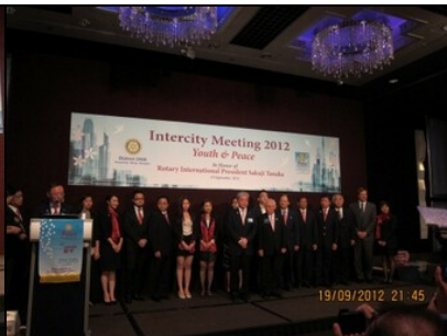
Eight new members from Six Clubs were inducted by RIP