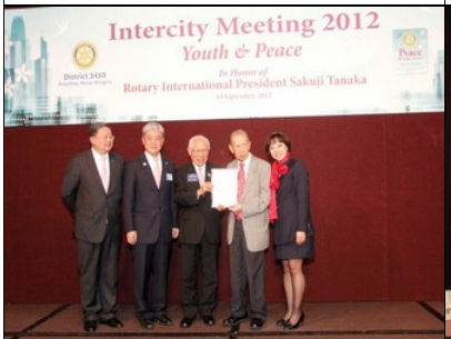
Letter of Congratulation to Uncle Peter by RIP Tanaka