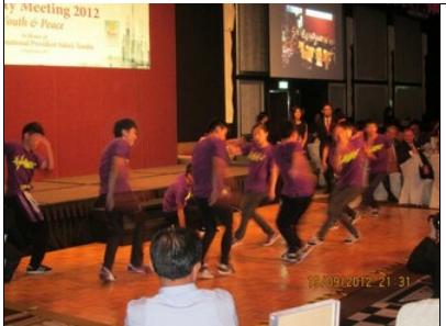
Hip Hop in Action