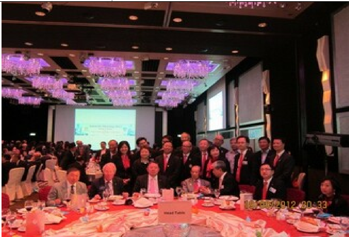
RC of HK Island East with RI President Sakuji Tanaka