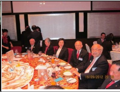
RIP Tanaka in Head Table