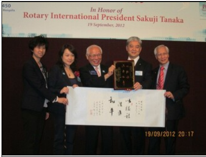
Another Gift to RIP