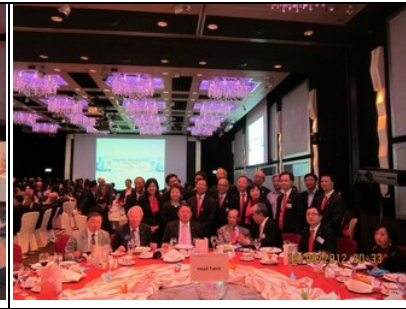
RC HKIE Members with RIP