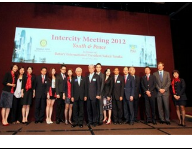
New Members and Respective Ps