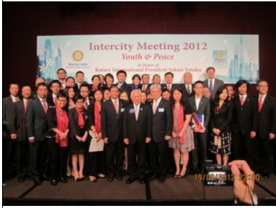
All New members, Ps and Proposers inducted after July 1