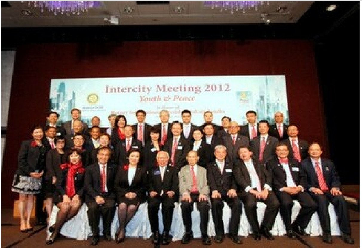
RC of HK Island East with RI President Sakuji Tanaka