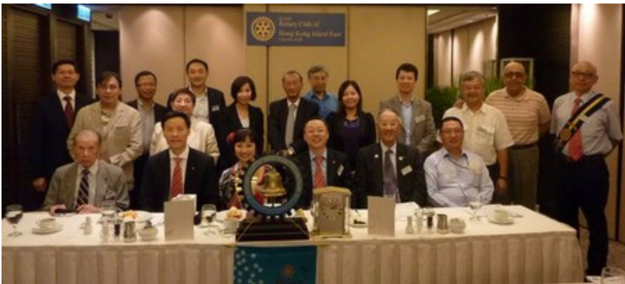
Group photo of Members of HKIE with visiting Rotarians & guests