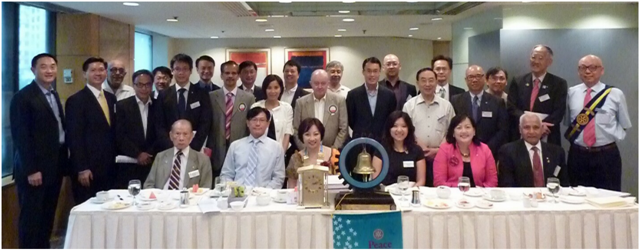
Group photos of HKIE members, visiting Rotarian & guests.