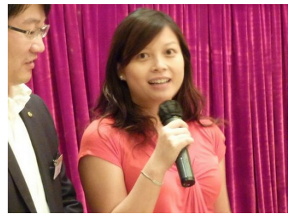
Each new member said a few words to thank the club members accepting them as a member of the Rotary Club of Hong Kong Island East