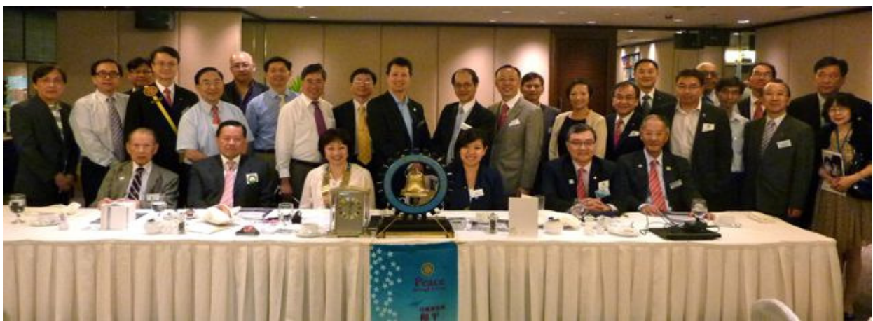
Group photo with members, visiting Rotarians & guests.