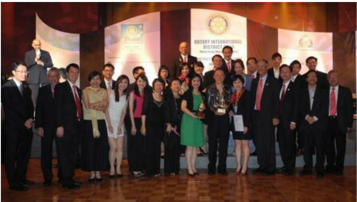
Group photo of RC of Hong Kong Island East