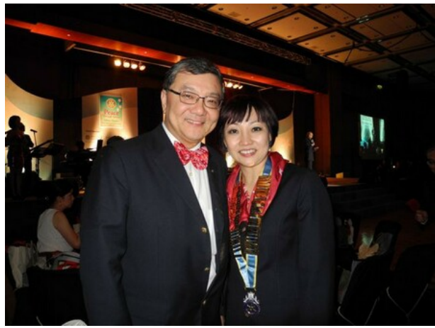
Entertainment performed by the 2011-2012 Presidents