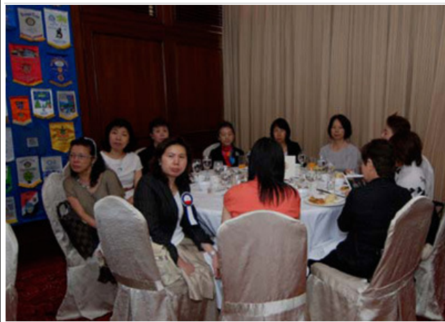
Rotaryannes from Kawasaki South & Guest from RC of HK Island East