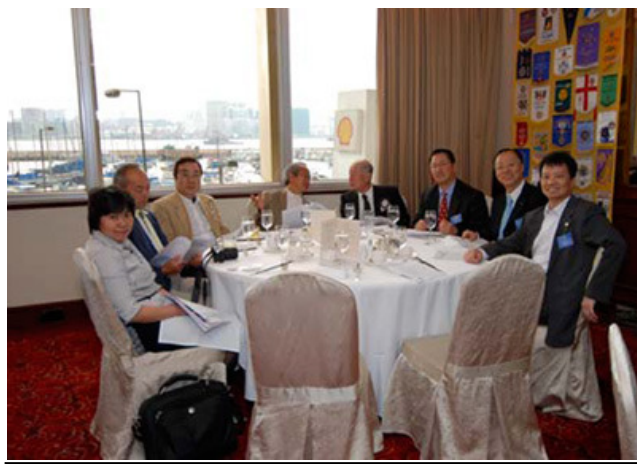
Members of RC of HKIE & Rotaryanne with Kawasaki South Members