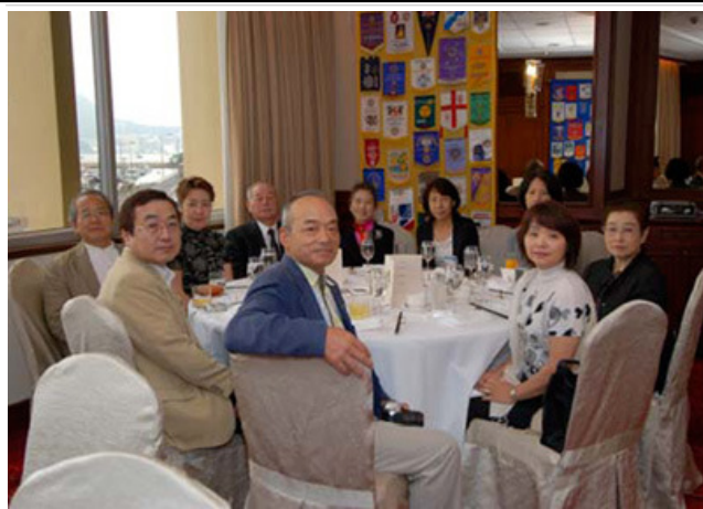
Members & Rotaryannes from Kawasaki South