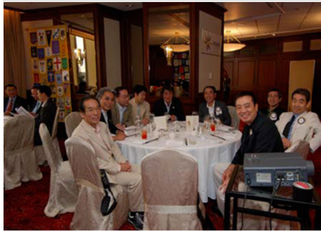
Members from Rotary Club of Kawasaki South