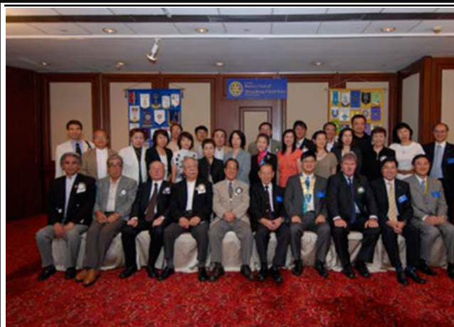
Group picture of RC of Kawasaki South, RC of Hong Kong Island East, Rotaryannes & Guests