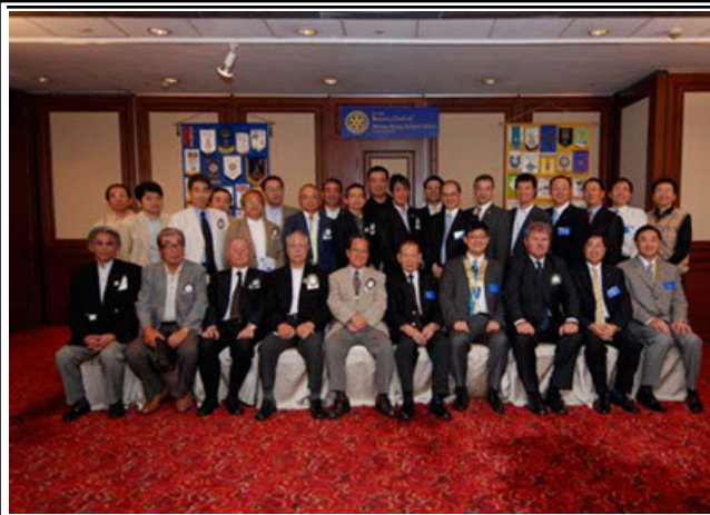
Group picture of RC of Kawasaki South & RC of Hong Kong Island East