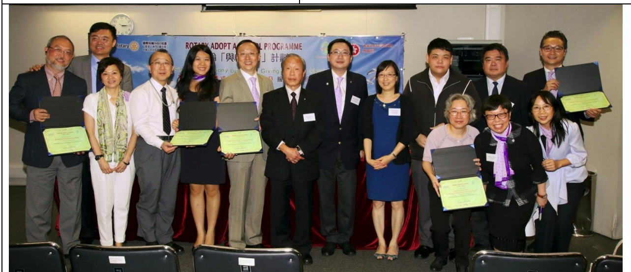
Thanks to the active participation from our RAAS Partners: Choi Chun School, Holy Carpenter Secondary School, our Sponsoring Rotaract Clubs: Hong Kong Island East, Lingnan University Students' Union, Hong Kong Community College Students' Union, and Interact Club of Holy Carpenter Secondary School and our Members.