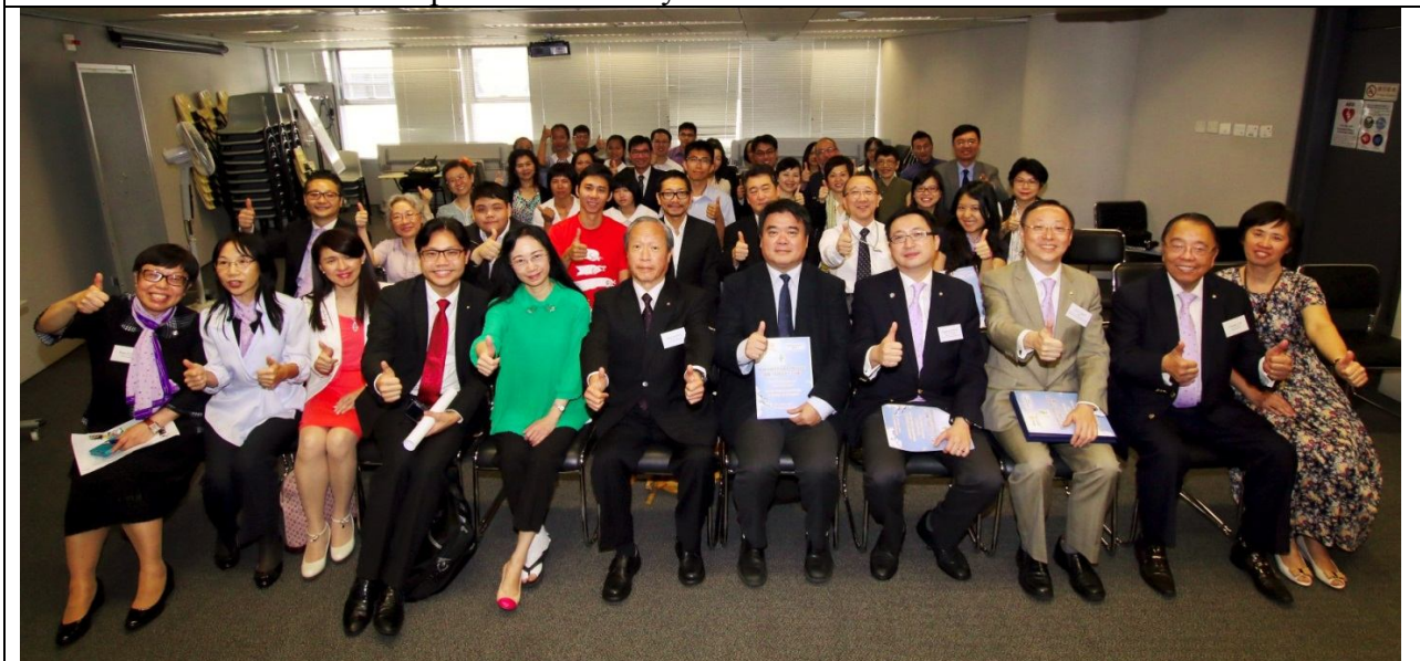
Group Photo of the gathering at the ceremony