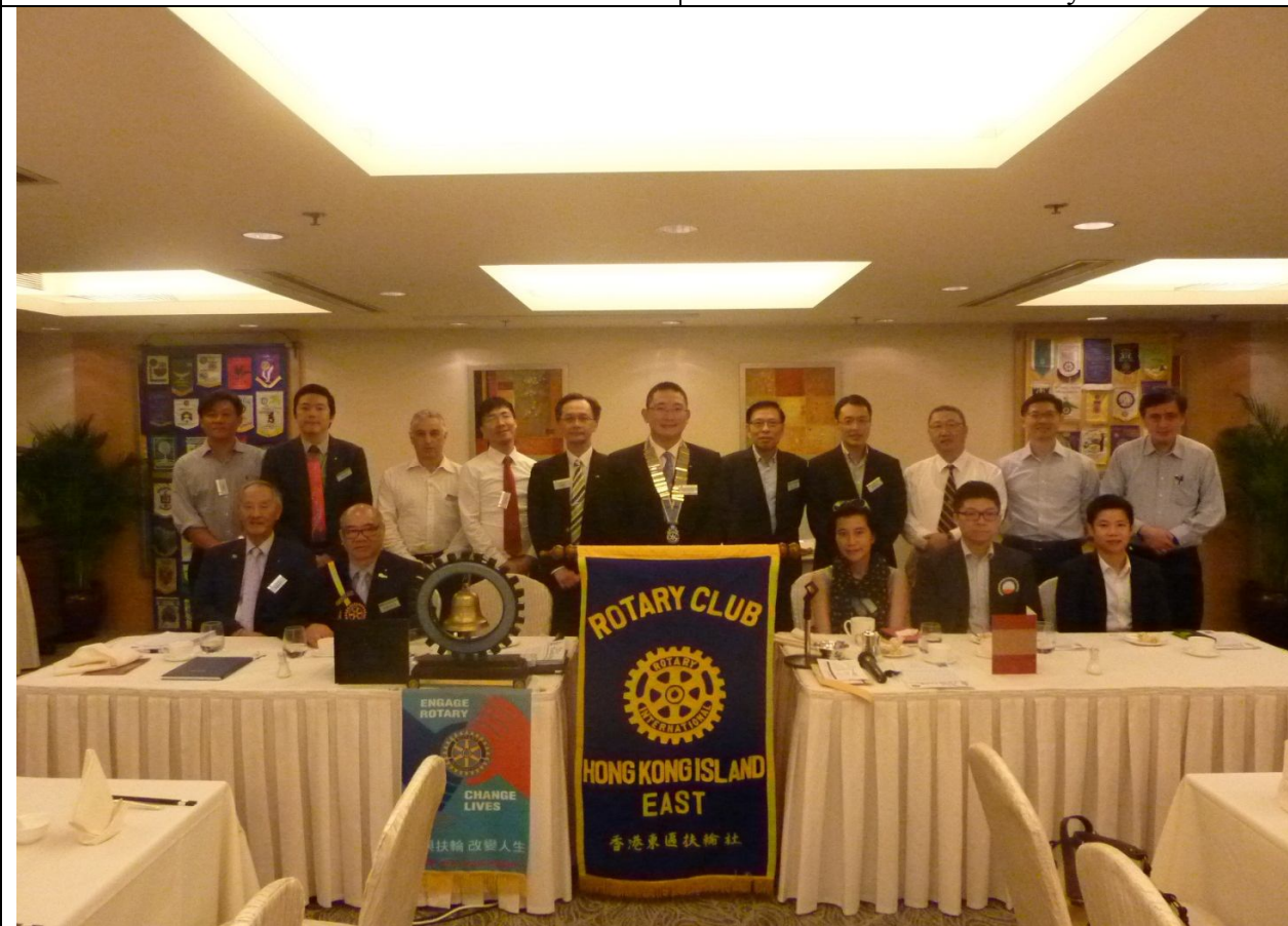
The group Photo of our meeting on 25 th June, 2014