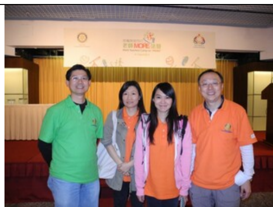
Two teachers (Choi Jun Sch.& Holy Carpenter Sec. Sch.) sponsored by RC HKIE