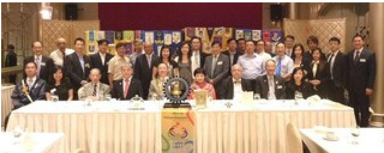
Group photo with visiting guests, visiting Rotarians & Club members