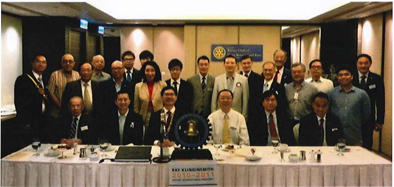
Group photos with Guest Speakers, visiting Rotarians, guests & club members