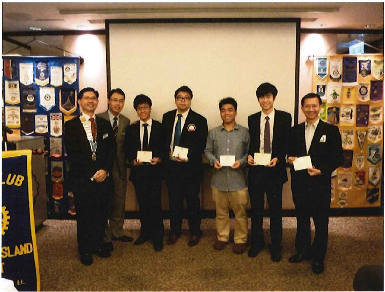
Photo with all the guest speakers & ASIA (Asia Social Innovation Award) Winners