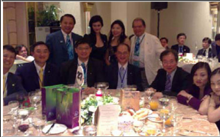
Group dimer photo with the beautiful ladies.