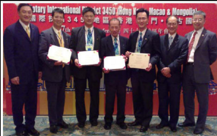
RC of HK Island East totally received FOUR District Awards.