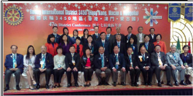
District Conference Organizing Committee.