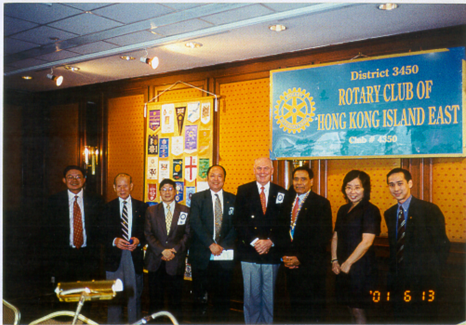
Visitors to the Club, 13 June, 2001.