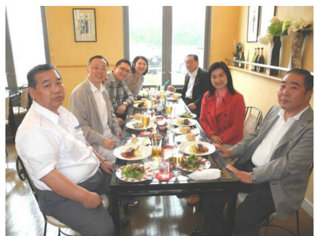
French Lunch in a L'Hotel de Hiei in Mount Hiei, Kyoto