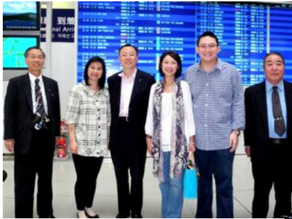
Reception in Osaka Airport