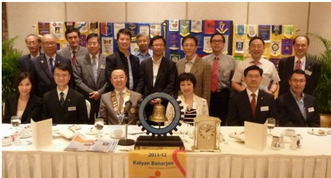
Group photo of participating members and guests