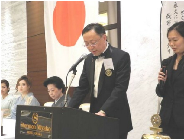
Pres. Eric addressed in Japanese