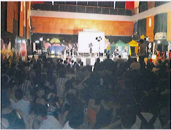
The venue, Youth Outreach Headquarter, Sai Wan Ho.