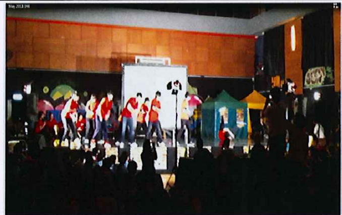
Our dancers in action