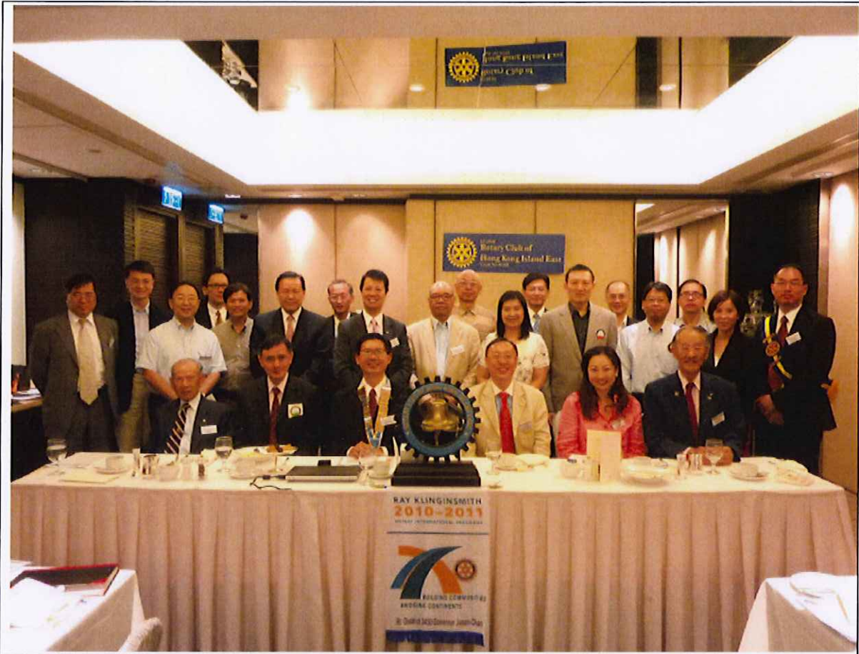
Group Photo of our meeting on the 1 st June, 2011.